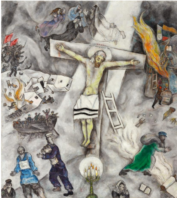
White Crucifixion by Marc Chagall

Welcome to Saint Elisabeth's. We are delighted to have you with us today.